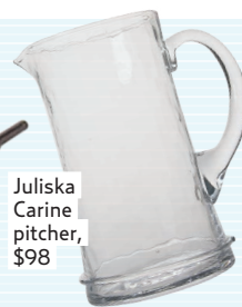
Juliska Carine pitcher, $98