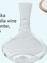
➔ Juliska Amalia wine decanter, $155