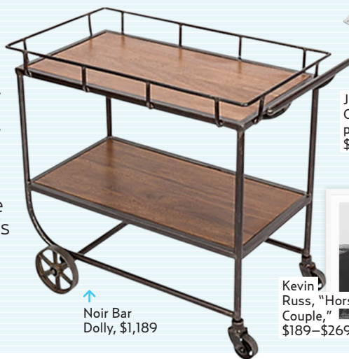
↑ Noir Bar Dolly, $1,189

A black-and-white photo and "smoky" handblown drinkware echo the pine and iron cart's "casual feel."