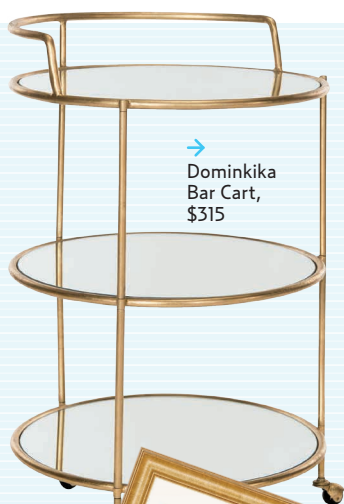
➔ Dominkika Bar Cart, $315

Matching a golden frame with a gilded, mirrored cart creates a "glamorous and party-ready station."