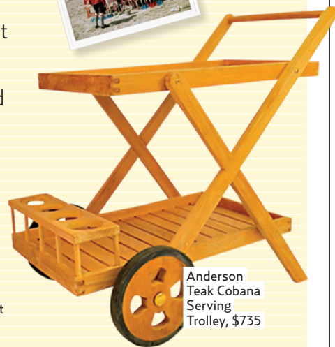
Anderson Teak Cobana Serving Trolley, $735