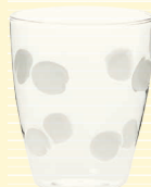
↑ Vietri Drop short tumbler, $40