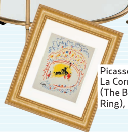
Picasso, La Corrida (The Bull Ring), $599